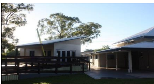
Picture: Well-being centre