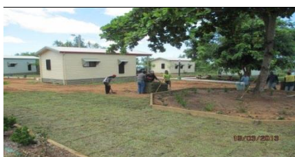
Picture: Mornington Island Motel