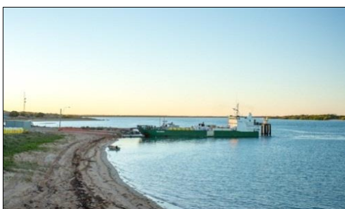
Picture: Barge at Mornington Island